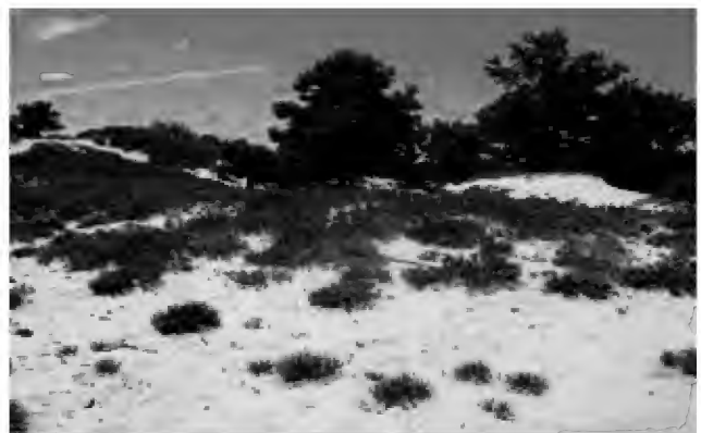
Figure 9. The landscape approaching the population of pale crested orchid in Napeague, on the South Fork. The dunes are sparsely vegetated by beach heather ( Hudsonia tomentosa ) and bearberry ( Arctostaphylos uva-ursi ); pitch pine occurs in the background and becomes dominant in a nearby, large blow-out/depression.

Eric was keen to show me the lovely hard-won protected area at Dwarf Pine Plains, Westhampton, Southampton Township, a fascinating habitat dominated by stunted pitch pine and with an abundance of goldenheather, the latter past bloom. Gold-